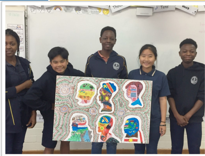
Students from our New Arrivals Program created beautiful artwork in celebration of Harmony Day.