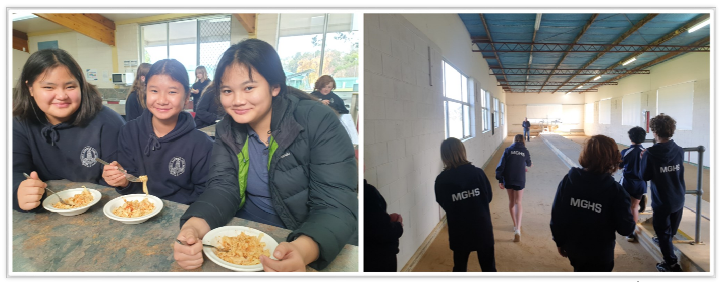
Mount Gambier High School | Page 3