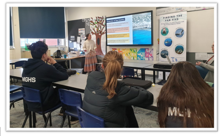
Mount Gambier High School | Page 2