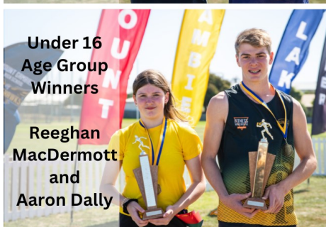
Under 16 Age Group Winners