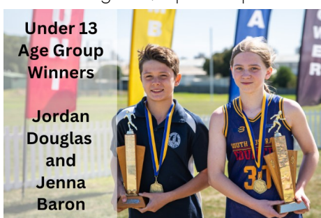
Under 13 Age Group Winners