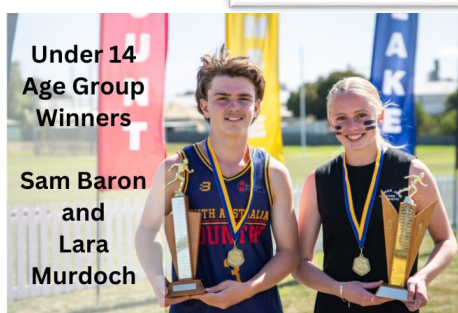
Under 14 Age Group Winners