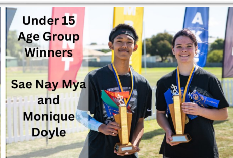
Under 15 Age Group Winners