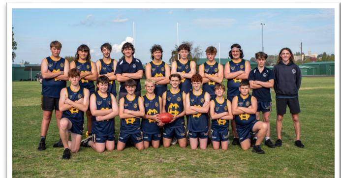
Mount Gambier High School | Page 3