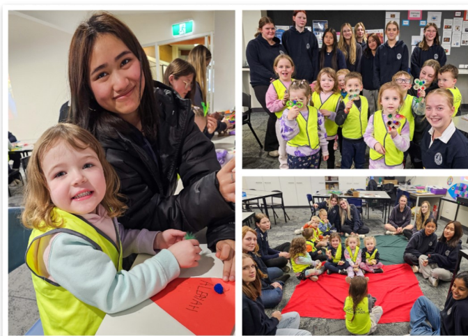
Mount Gambier High School | Page 2